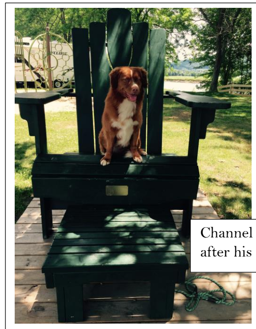
Channel relaxing after his big win!